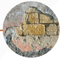
Cement and plaster