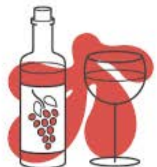
Sulphur Dioxide and Sulphites