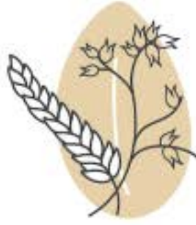
Cereals containing gluten